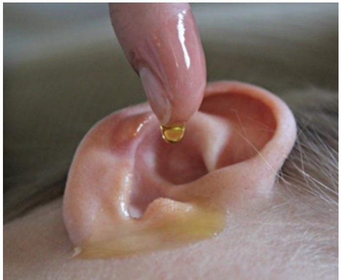
No Pill Can Cure Tinnitus; Try This Instead