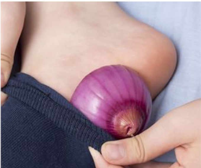
Diabetes Will Kill You (Do This To Stop It)