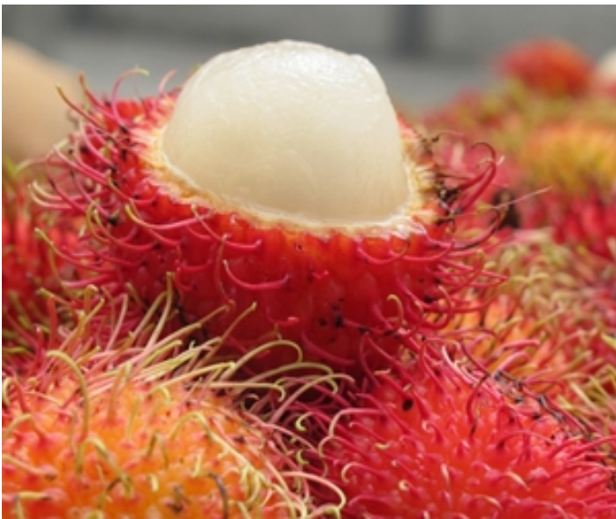
Nature's Secret Weapon Against Diabetes