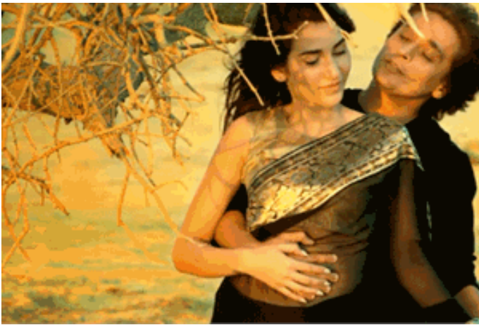
Raasta review: It's Sahir Lodhi against your sanity