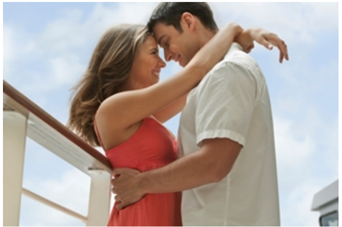
The Secret One Mother Used to Get Rid of Belly Fat