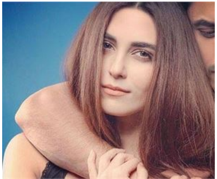
Maya Ali pens heartfelt note for co-star Ali Zafar