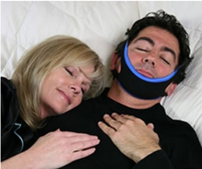
How to Stop Snoring and Improve Your Health